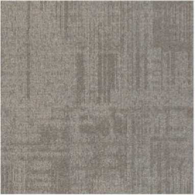
Alternating 3 **