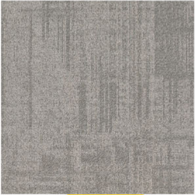
Alternating 1 **